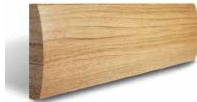
Crescent Valance available on 2 & 2.5" Signature Faux Wood 2" Signature Composite Woodgrain