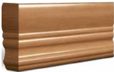
Crown Valance 2 & 2.5" Signature Faux Wood

The Deluxe Cordless is available up to 84" x 84". Blinds over 84" x 84" must use the Lift N Lock system. See page 2