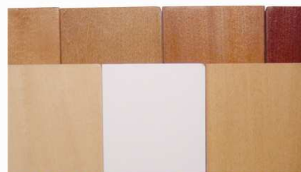
NEW Kensington Wood Collection