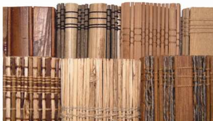
NEW Kensington Woven Wood Collection